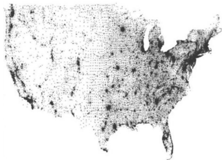
Urban Areas Affected First -National Spread Within 1-2 Months